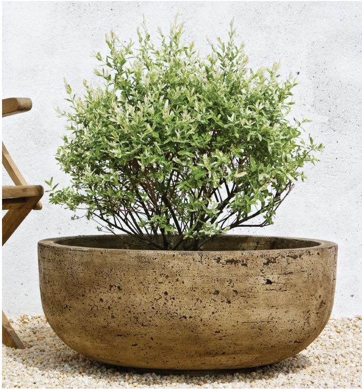
Shown in Brownstone